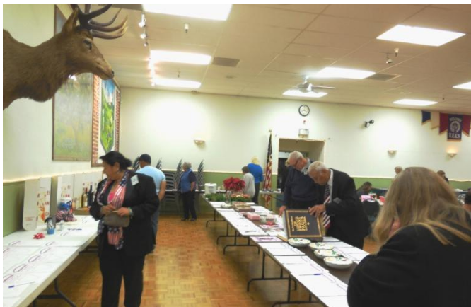
Searching for the best buy